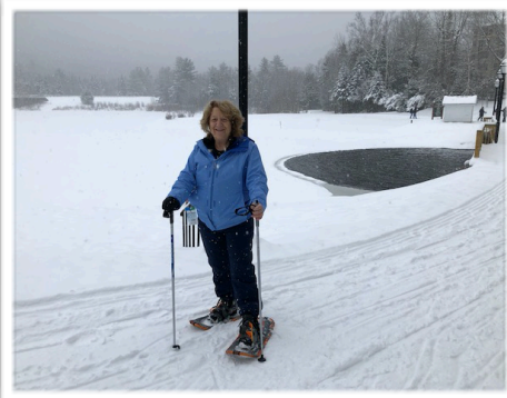
Snowshoe Trip Leader & Nordic Center in Waterville Valley

TAG US ON FACEBOOK, OR EMAIL TO PAMAINLINESKICLUB.COM TO HAVE THEM ADDED TO OUR NEWSLETTER, WEBSITE, OR FACEBOOK PAGE.